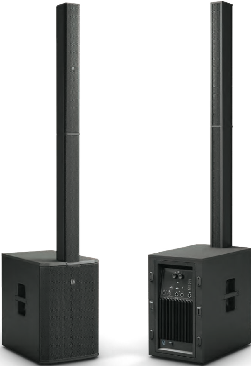
MAUI® 44 G2 POWERED CARDIOID COLUMN LOUDSPEAKER