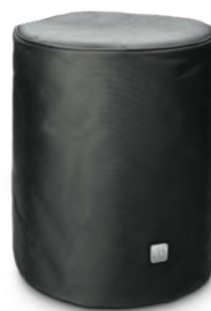
MAUI® 5 SUB BAG PROTECTIVE COVER FOR MAUI 5 AND MAUI 5 GO SUBWOOFER