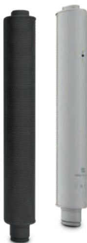
MAUI® 5 GO BC (W) EXCHANGEABLE BATTERY COLUMN FOR MAUI 5 GO