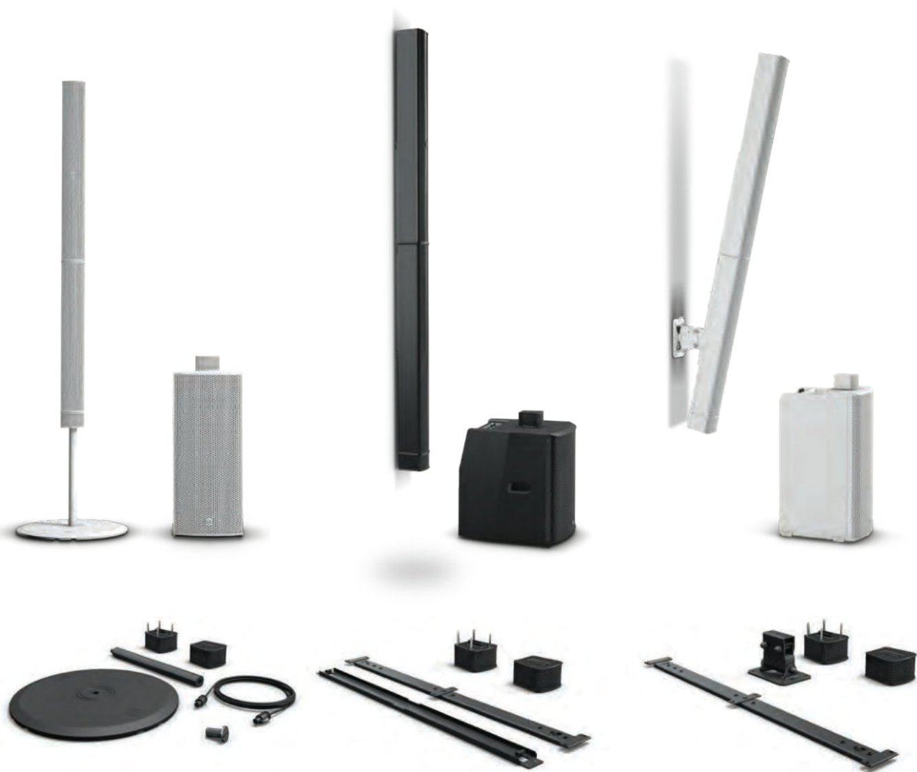
M G2 SPS (W) FLOOR STAND KIT FOR MAUI G2 COLUMNS