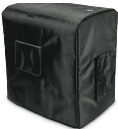
MAUI® 44 G2 SUB PC PROTECTIVE COVER FOR MAUI 44 G2 SUBWOOFER