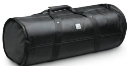
MAUI® 5 SAT BAG TRANSPORT BAG FOR MAUI 5 AND MAUI 5 GO COLUMN SPEAKERS