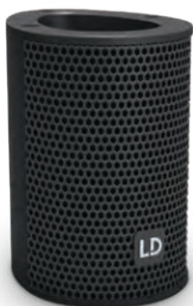
MAUI® 5 GO CD CHARGING DOCK FOR MAUI 5 GO BATTERY COLUMN