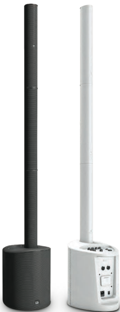
MAUI® 5 (W) ULTRA-PORTABLE COLUMN PA SYSTEM WITH MIXER AND BLUETOOTH