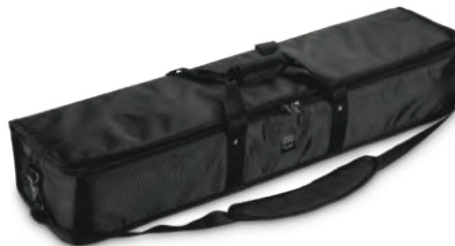
MAUI® 44 SAT BAG TRANSPORT BAG FOR MAUI 44 G2 COLUMN SPEAKER