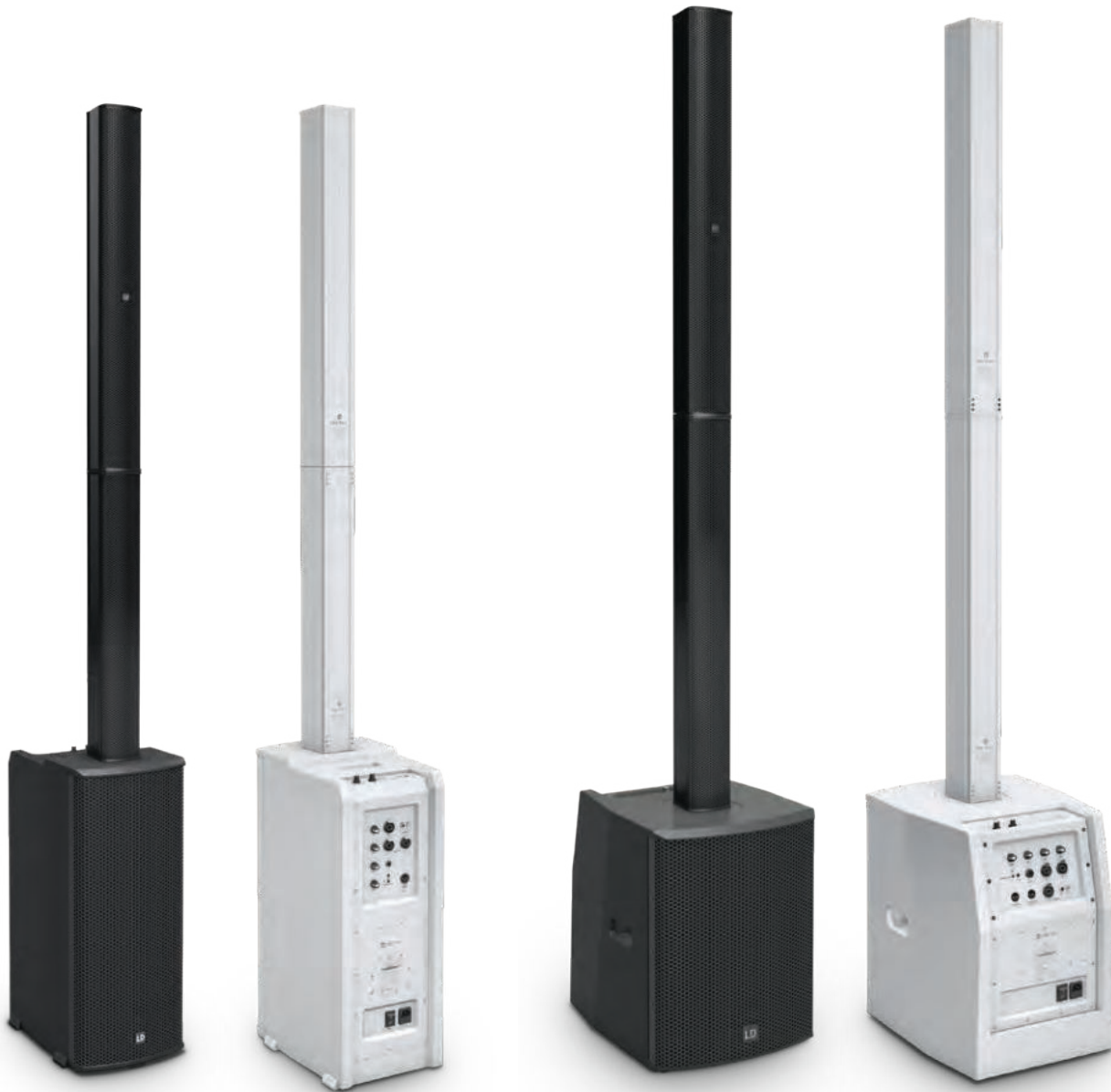
MAUI® 11 G2 (W) PORTABLE COLUMN PA SYSTEM WITH MIXER AND BLUETOOTH