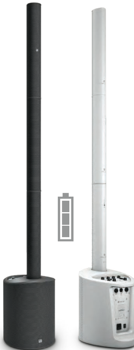
MAUI® 5 GO (W) ULTRA PORTABLE BATTERY-POWERED COLUMN PA SYSTEM WITH MIXER