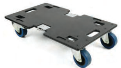
MAUI® 44 CB CASTOR BOARD FOR MAUI 44 G2 COLUMN POWERED PA SYSTEM