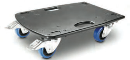
MAUI® 28 G2 CB DOLLY BOARD FOR MAUI 28 G2